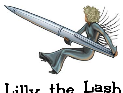
Lilly the Lash

Best to use either one or both of these cut outs on white hangers (You could cut in a square and glue to the hanger)